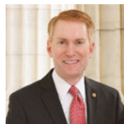
James Lankford United States Senator