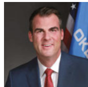
Kevin Stitt Governor of Oklahoma

To wrap-up the convention weekend, Sen. James Lankford will lead members in a worship service on Sunday morning.